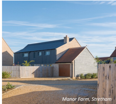
Manor Farm, Stretham

With property prices at historic highs compared to wages, a 'displacement cycle' has taken root where people move further away from the places they