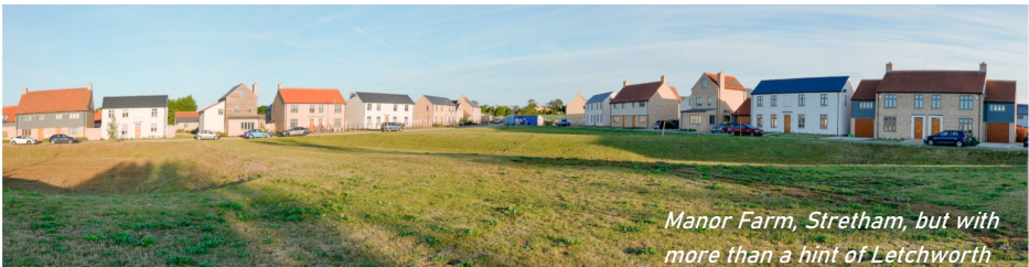
Manor Farm, Stretham, but with more than a hint of Letchworth

The SWCLT is an innovative scheme, but it also has echoes with a movement of more than 100 years ago.